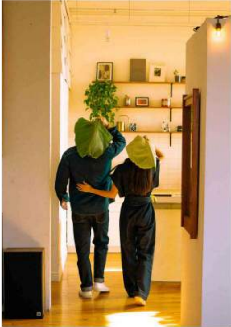
Authenticity Transparency Connection